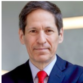
Tom Frieden, MD President and CEO Resolve to Save Lives

Dr. Tom Frieden is a physician trained in internal medicine, infectious diseases, public health, and epidemiology. He is former director of the US Centers for Disease Control and Prevention and former commissioner of the New York City Health Department. Dr. Frieden is currently President and CEO of Resolve to Save Lives .